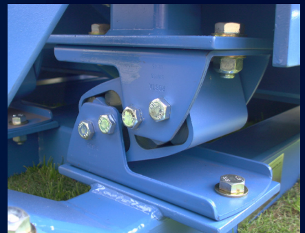
ROSTA ESL anti-vibration mount