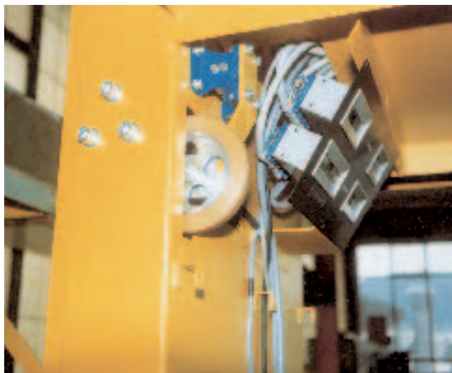
Elastic suspension of caliper roll in elevator