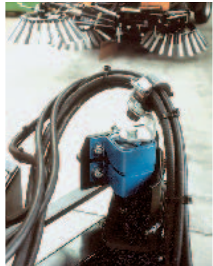
Suspension of a brush in road sweeper