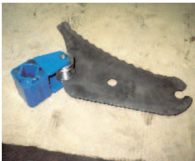
Elastic suspension of shaping knife in baler