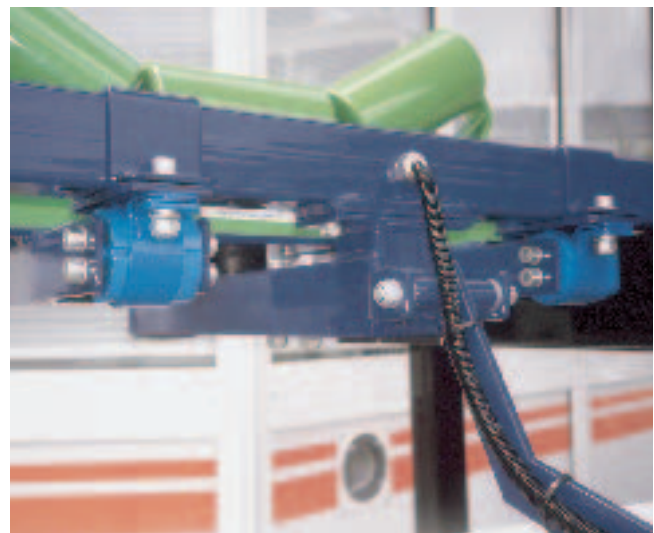
"Floating" suspension of weighing device in belt conveyor