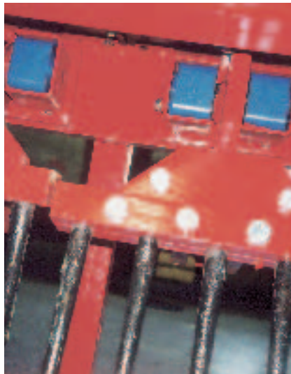
Elastic suspension of a rake in potato harvester